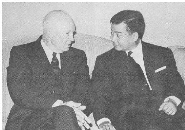
Dwight D. Eisenhower and Prince Norodom Sihanouk

A review of the three books for the History News Network draws lessons from them for current American foreign policy, particularly “the disturbing tendency to disregard regional history and culture in favor of larger ideo-